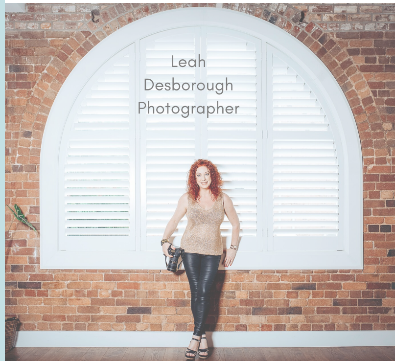
Leah Desborough Photographer